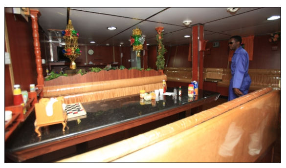
Ekulo Explorer's Galley